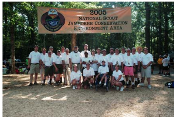
2005 A&WMA-WEF Group Photo

THANK YOU A&WMA JAMBOREE EXHIBIT VOLUNTEERS!